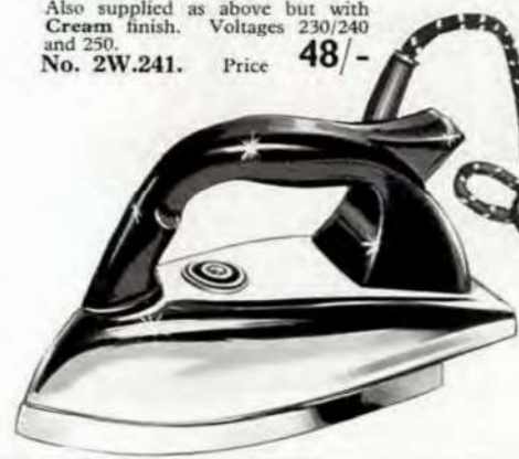
B No. 2W.612.

(A) G.E.C. "SUPERSPEED" CHROMIUM PLATED ELECTRIC IRON Thermostatically Controlled Medium Weight Iron. Comprising snap action thermostat, causing no interference to T.V. or Radio. Pilot light. Cast iron chromium plated sole plate with clamp on mica element. 7 ft. 6 in. non-kinking flex. Voltages 230/240 and 250. 750 Watts. A.C. only No. 2W.239. Price 55/- Also supplied as above but with Cream finish. Voltages 230/240 and 250. No. 2W.241. Price 48/-