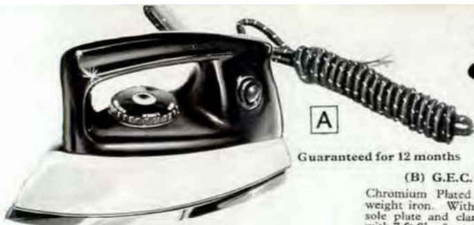
A Guaranteed for 12 months

(A) G.E.C. "SUPERSPEED" CHROMIUM PLATED ELECTRIC IRON Thermostatically Controlled Medium Weight Iron. Comprising snap action thermostat, causing no interference to T.V. or Radio. Pilot light. Cast iron chromium plated sole plate with clamp on mica element. 7 ft. 6 in. non-kinking flex. Voltages 230/240 and 250. 750 Watts. A.C. only No. 2W.239. Price 55/- Also supplied as above but with Cream finish. Voltages 230/240 and 250. No. 2W.241. Price 48/-