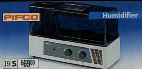
19 S £69.50