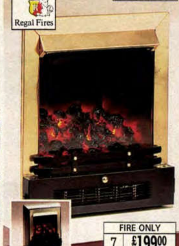
FIRE ONLY 7 £19900

1 PRILECT 434 FUEL EFFECT FIRE. 2 kW radiant fire. 2 heat settings with 2 x 1 kW radiant elements. Log effect can be operated without heat output. Size (H)40, (W)63, (D)22 cm.