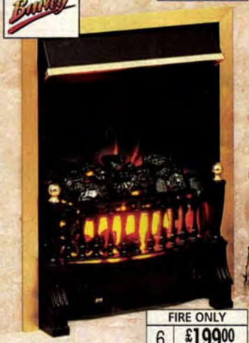
FIRE ONLY 6 £19900