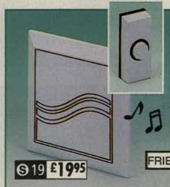
S 19 £1995