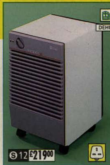
S 12 £21900