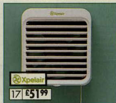
Xpelair 17 £5199