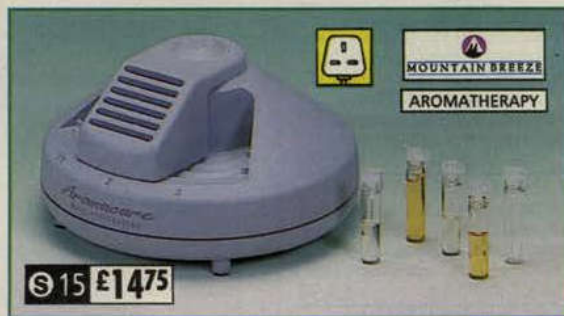
S 15 £1475