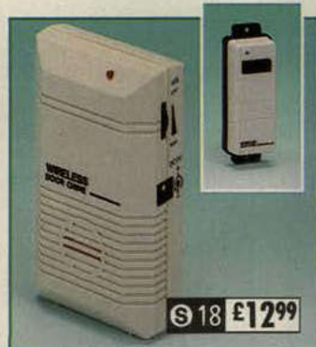
S 18 £1299