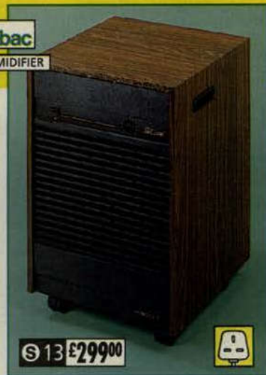
S 13 £29900