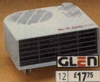
GLEN 12 £17.75