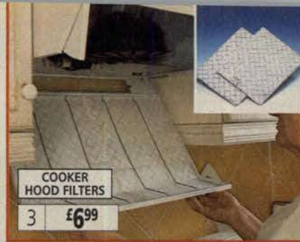
COOKER HOOD FILTERS