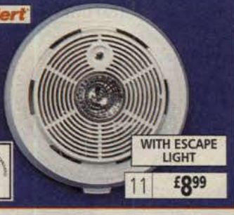
WITH ESCAPE LIGHT