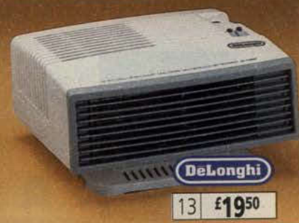
DeLonghi 13 £19.50