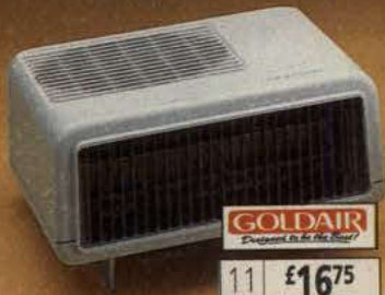
GOLDAIR 11 £16.75